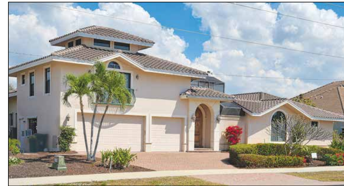
281 N. Barfield Dr. Marco Island, FL 34145 DIRECT GULF Access

To Advertise in the Marco Island Gazette, Call 239-963-4656