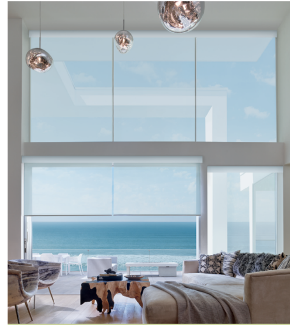
Motorized Designer Roller Shades

Custom window treatments from Louver Shop will last a lifetime and make all the important places in your home look and feel special.