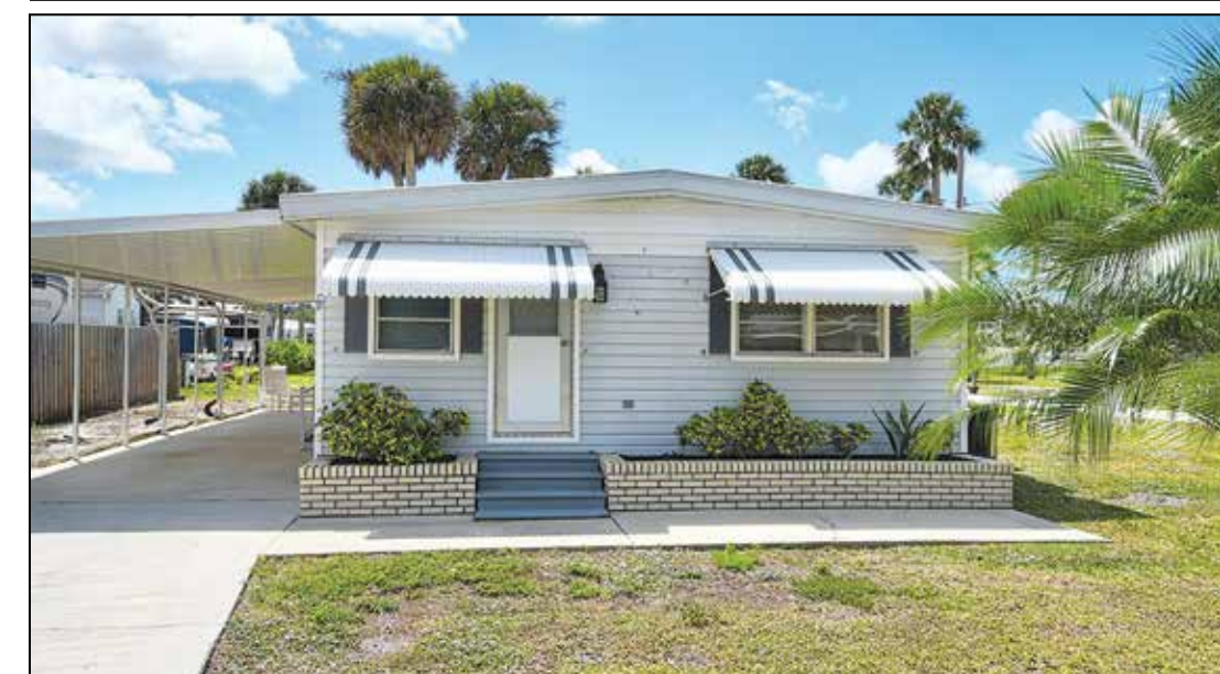
18 Henderson Dr. Naples, FL 34114 INDIRECT GULF Access