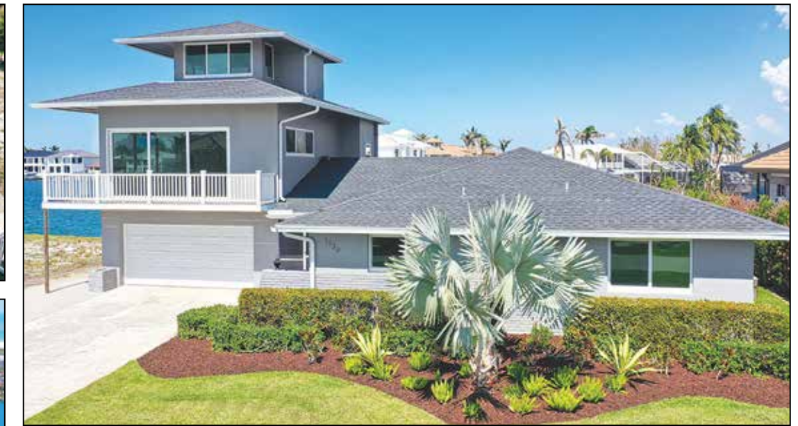
1030 Coronado Ct. Marco Island, FL 34145 INDIRECT GULF Access